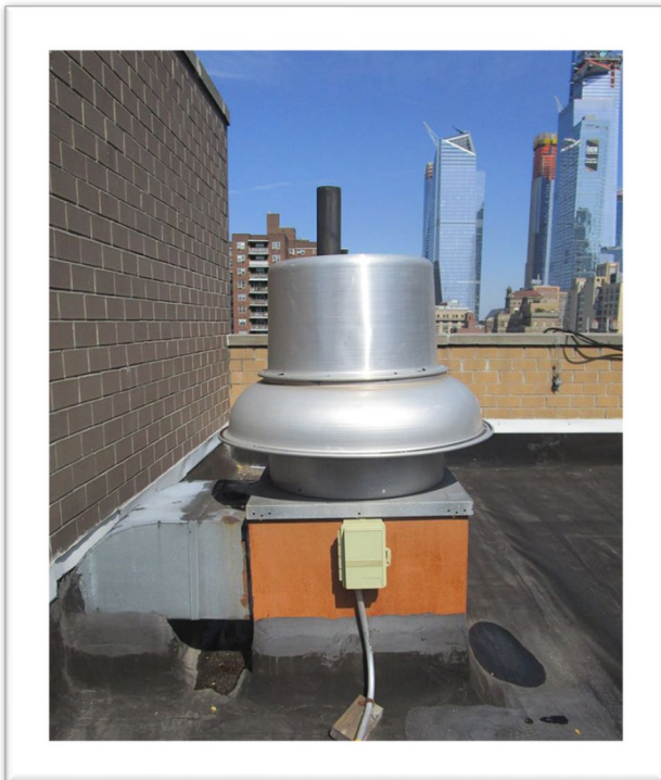
Labeled “no open flame”